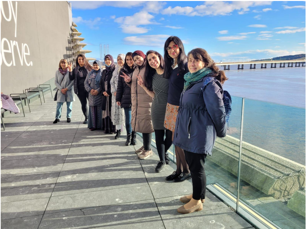
Beginners English Class visit to V&A Dundee