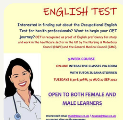
Advertising OET Class