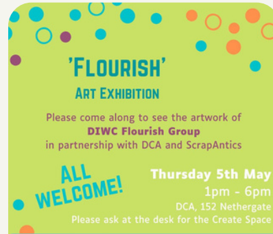
Flourish Art Exhibition