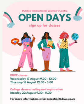
Summer Open Day