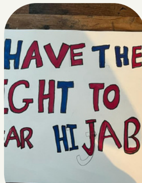
16 Days Art