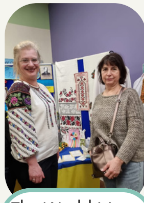
The World Meets in Stobswell