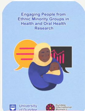
A Placement Student's Project