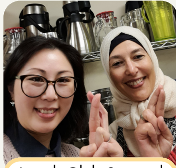
Lunch Club Started