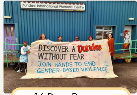
16 Days Banner