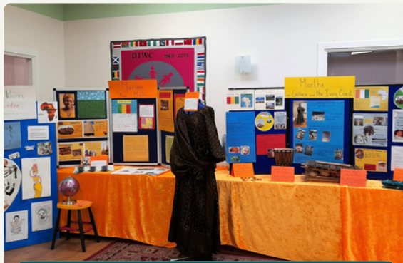
Black History Month