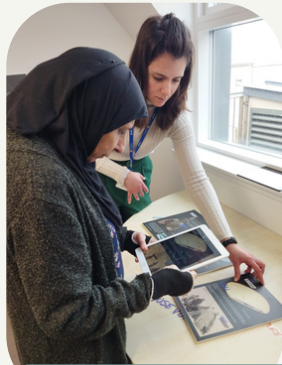
English for Life Visit to the Wardlaw Museum