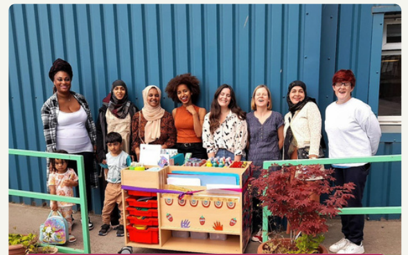
Flourish Class with Art Cart