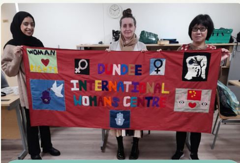
16 Days Art